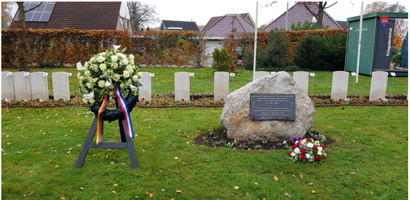
Also a ceremony in Schoonebeek.