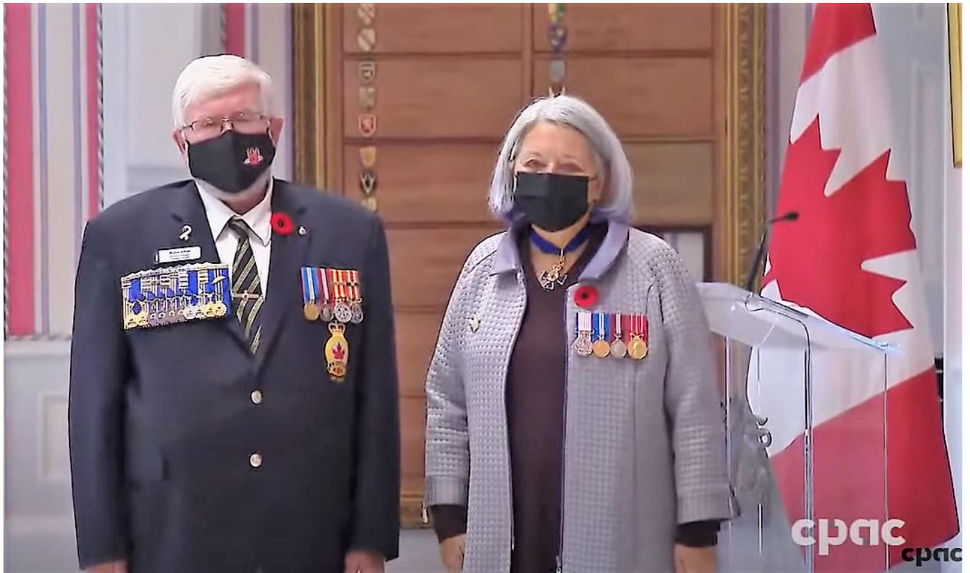
First Poppy for the Governor General