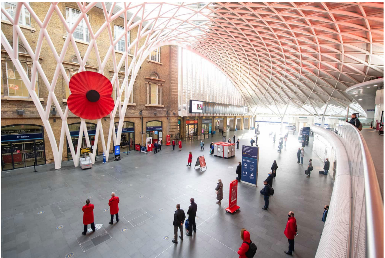
Two minutes of silence. King's Cross Station London