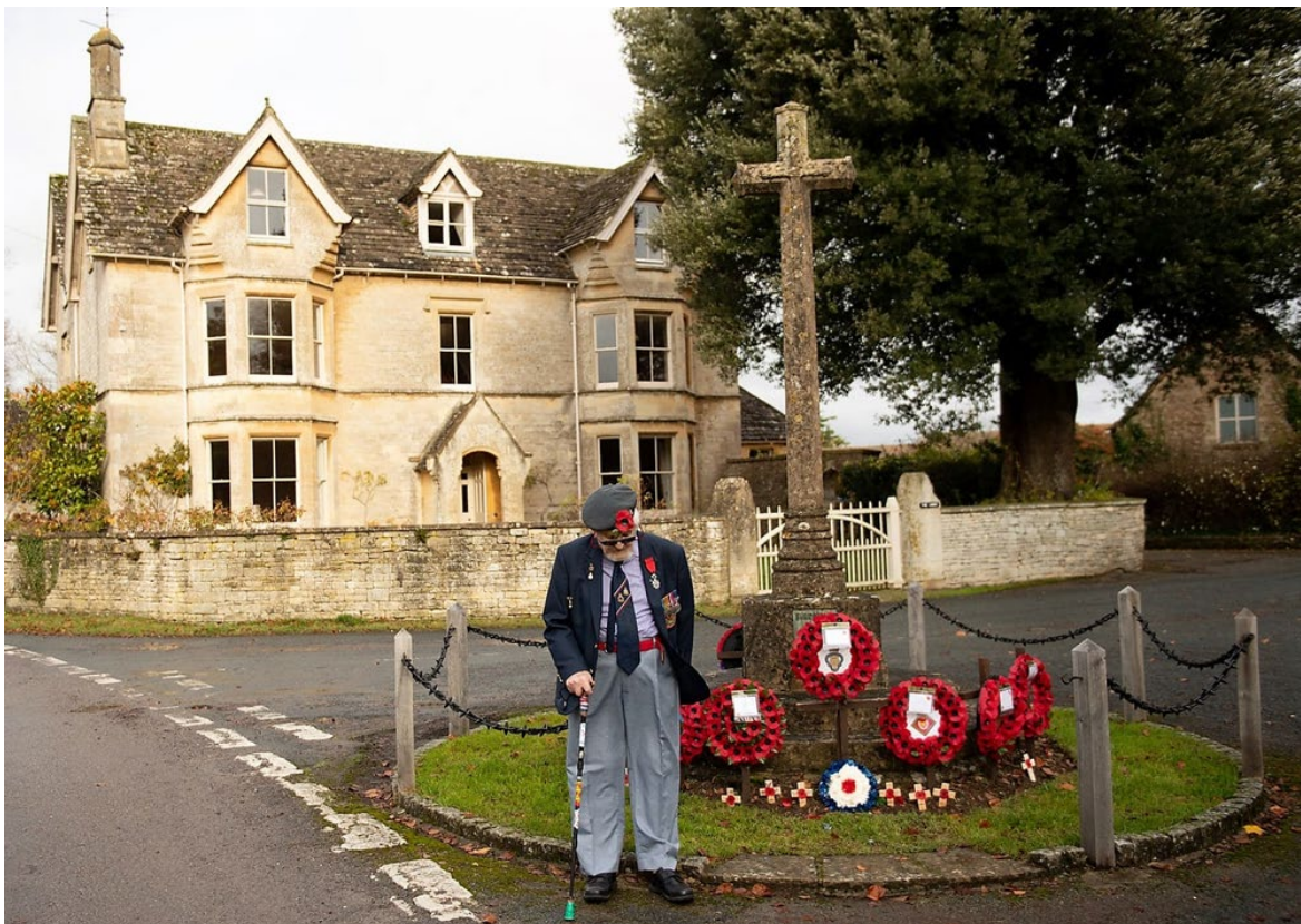
A RAF Veteran observes the two minute silence at a war memorial by his home in Cirencester in Gloucestershire