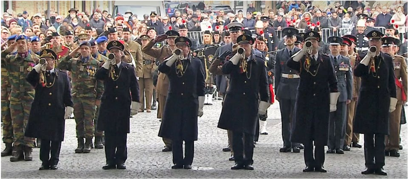
Menin Gate Ypres