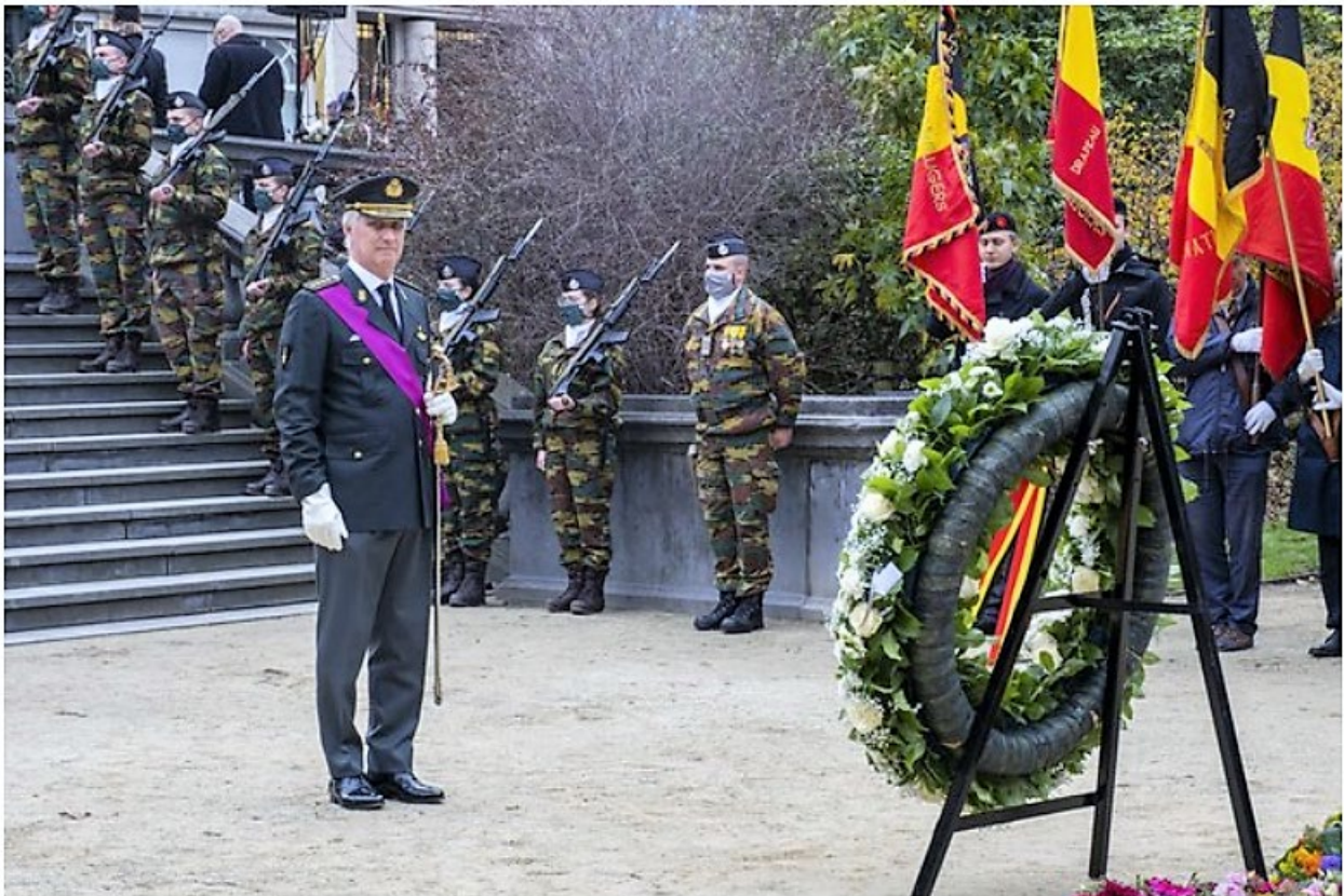
In Brussels King Philip attended the ceremony.