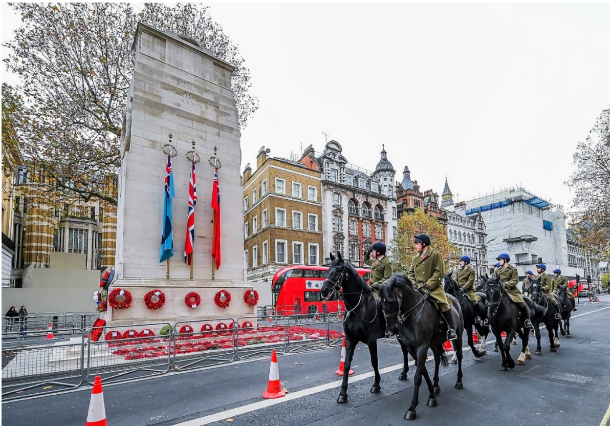
A troop of the Household Cavalry pay their respects in the early morning at the Cenotaph