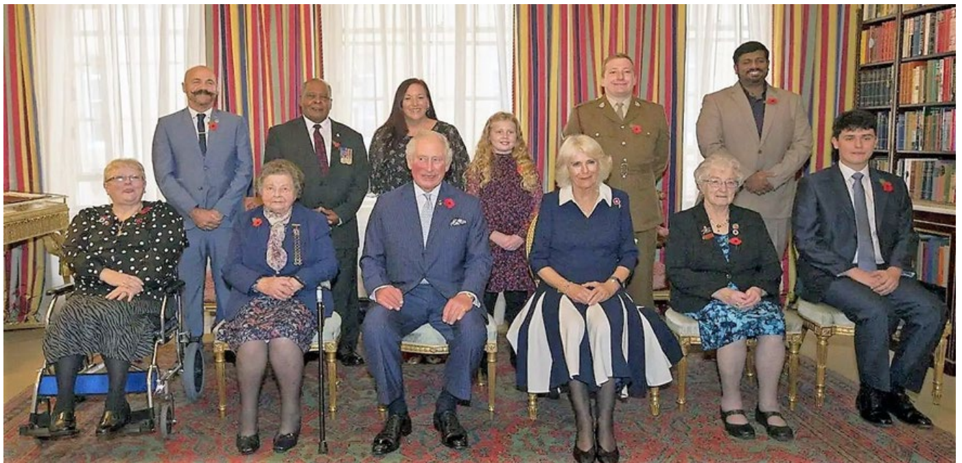
Prince Charles and the Duchess of Cornwall meet ten Poppy Appeal volunteers