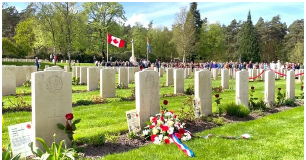
Still from the video