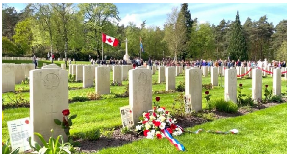
Still from the video