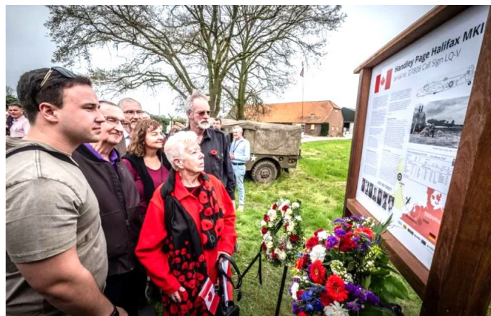
Relatives at the information board

Now there is an information board at the crash site for the crew of the Halifax II DT808. Five crew members lost their lives here, two managed to save themselves.