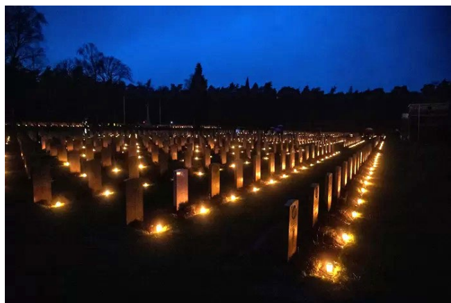
Holten