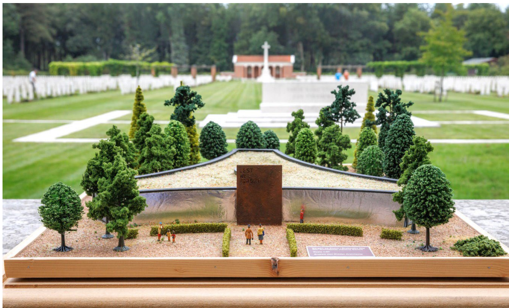
Model of the Plan

With a balanced budget and a final zoning plan, the intention is to start construction in 2024.