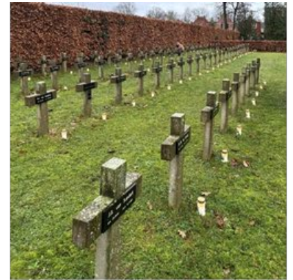
Roosendaal