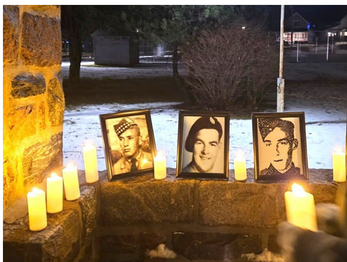
Branch 68 Penetanguishene Ontario