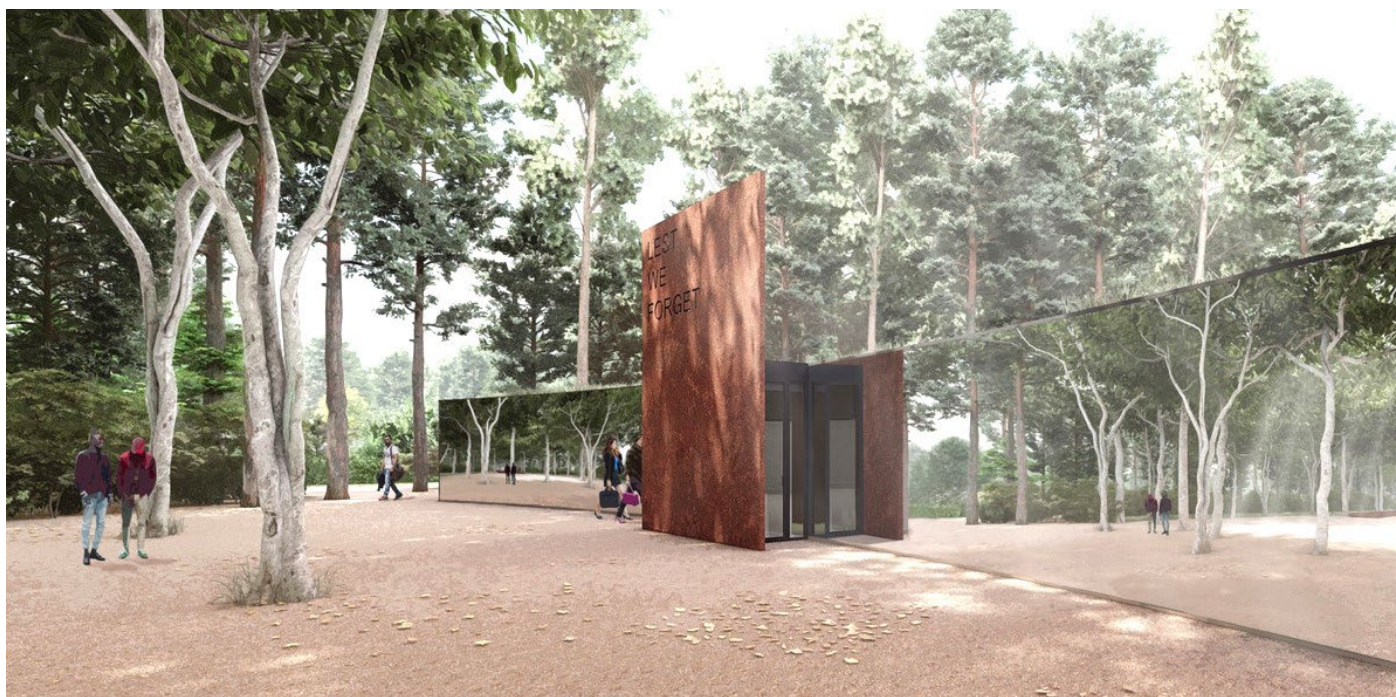
Impression of the entrance © Grasso den Ridder Architects