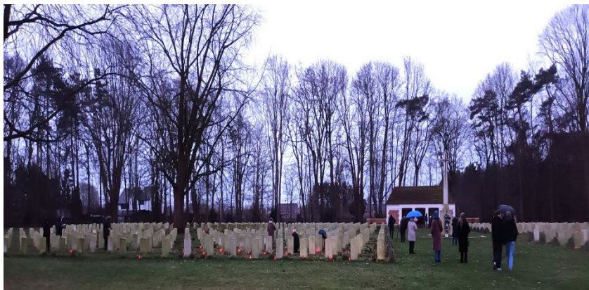
Adegem (B)