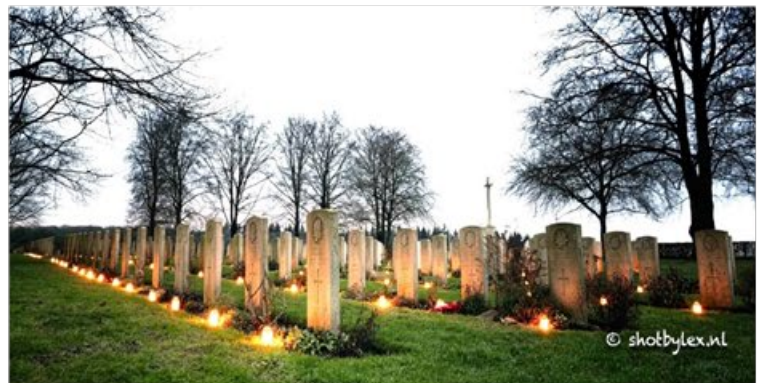
Groesbeek 2 © Lex Schulte nr. 1 en 2