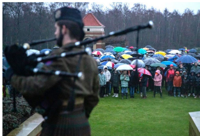
Holten