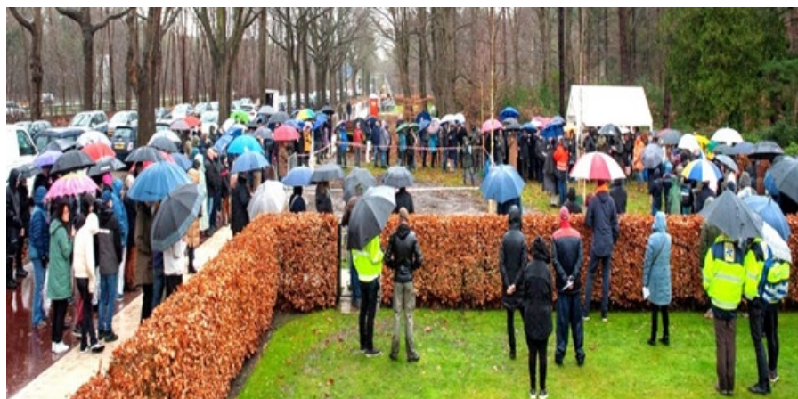
Bergen op Zoom