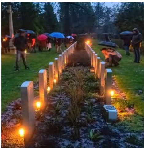
Oosterbegraafplaats Enschede