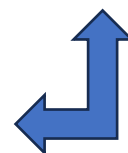
Branch 68 Penetanguishene