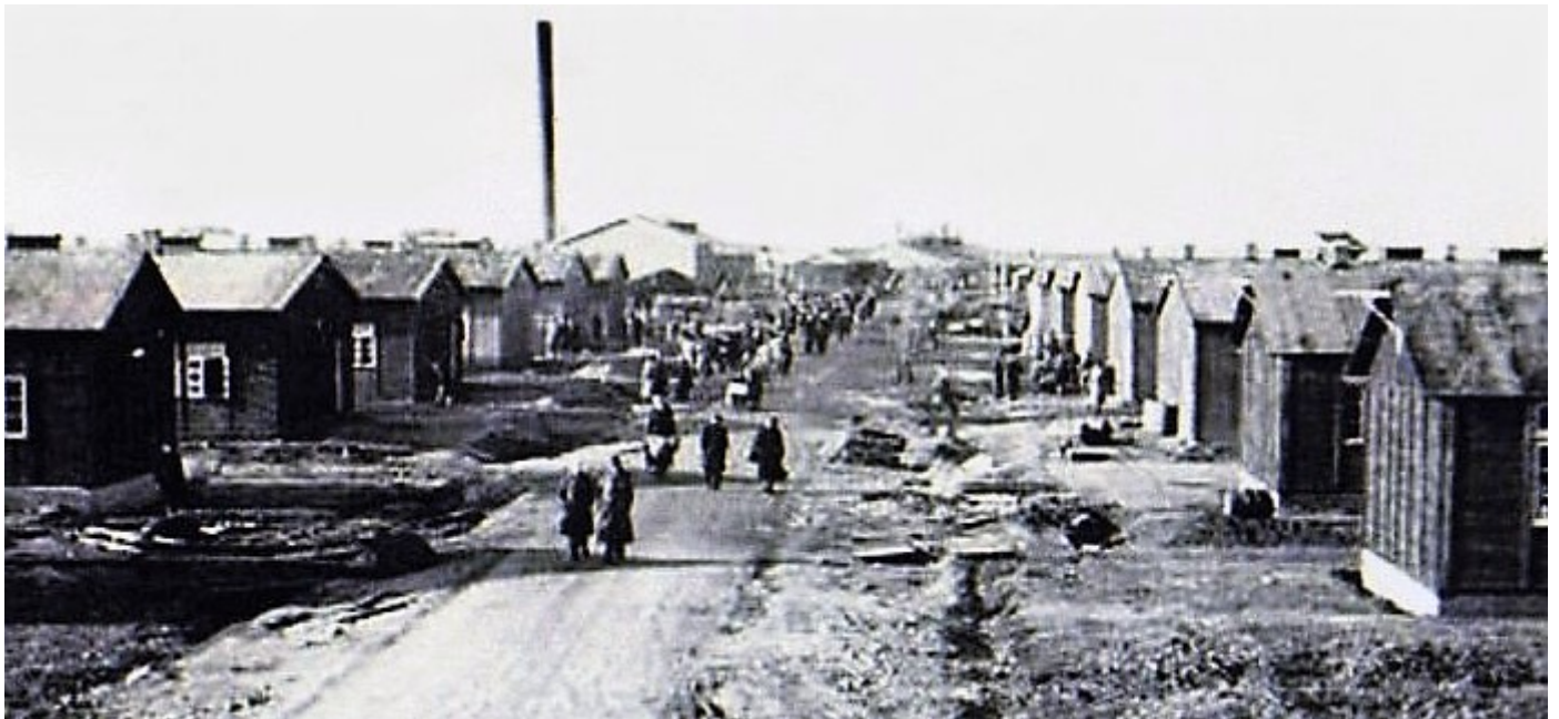
Camp Westerbork. "Le Boulevard des Misères" this road was called by the prisoners