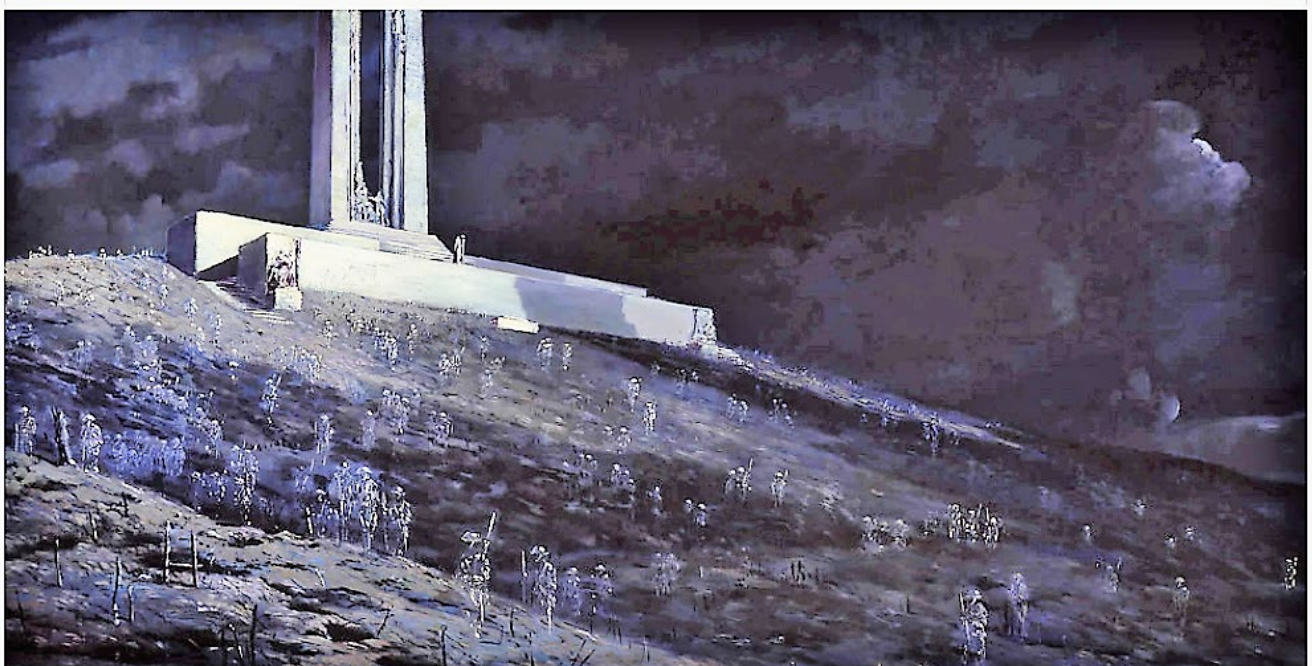
Ghosts of Vimy Ridge Image by Will Longstaff