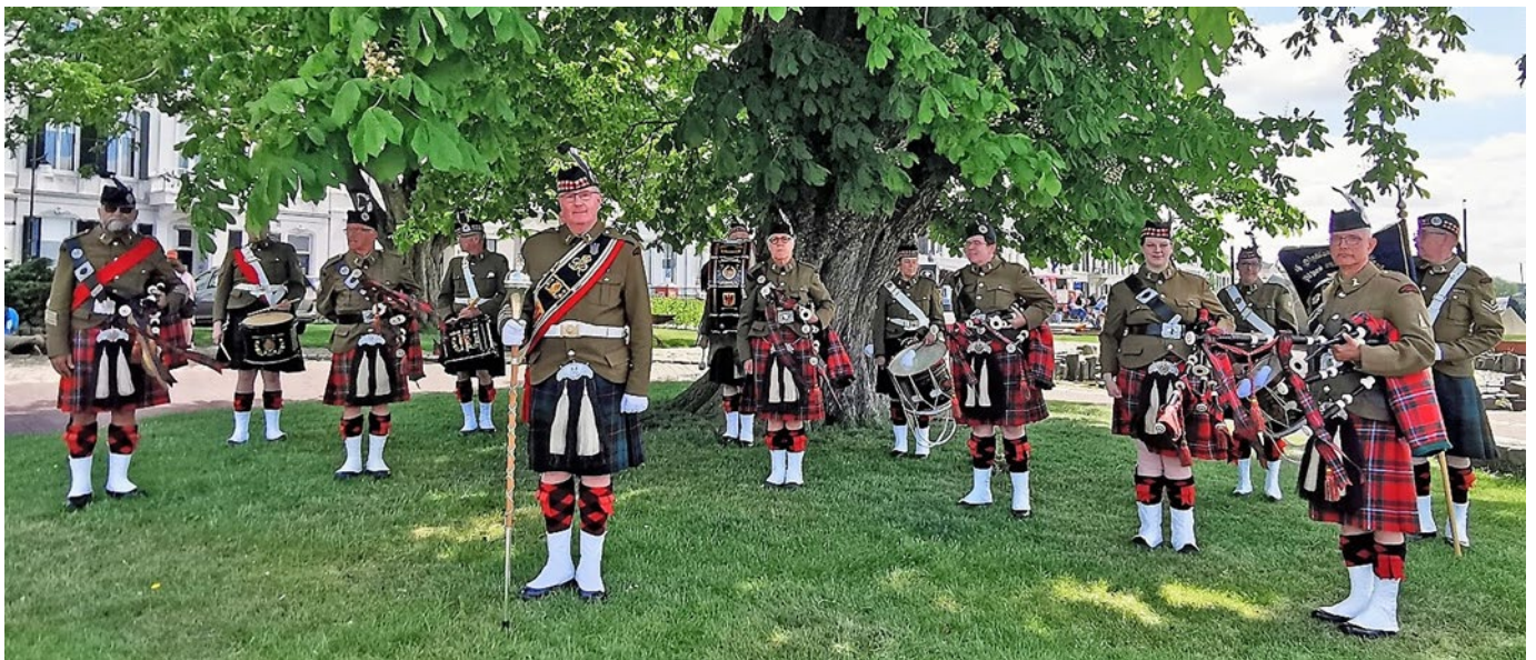
Veterans Day Zutphen 2019

They intended to celebrate this anniversary with a nice concert, but unfortunately this was not possible due to the COVID-19 rules.