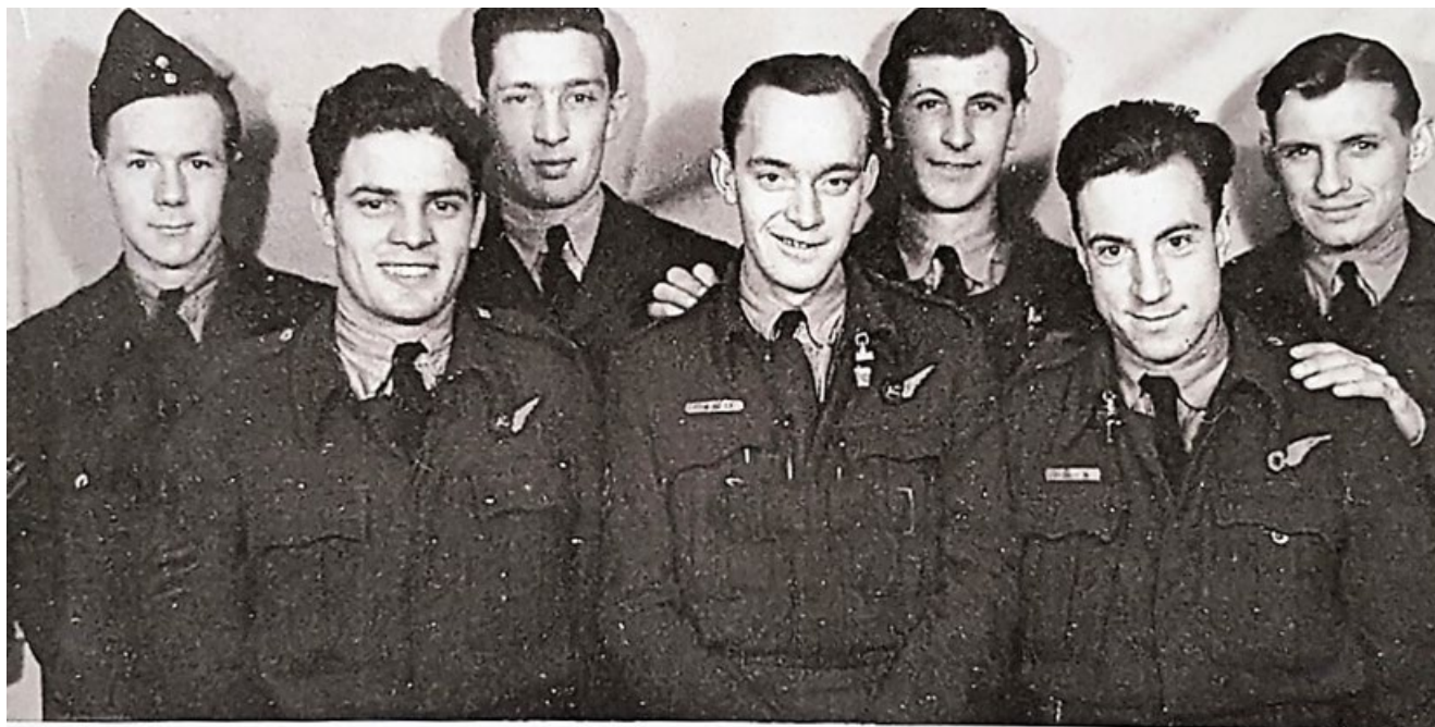
Crew Lancaster B1-R5572 Crashed 26-06-1943 in Baak