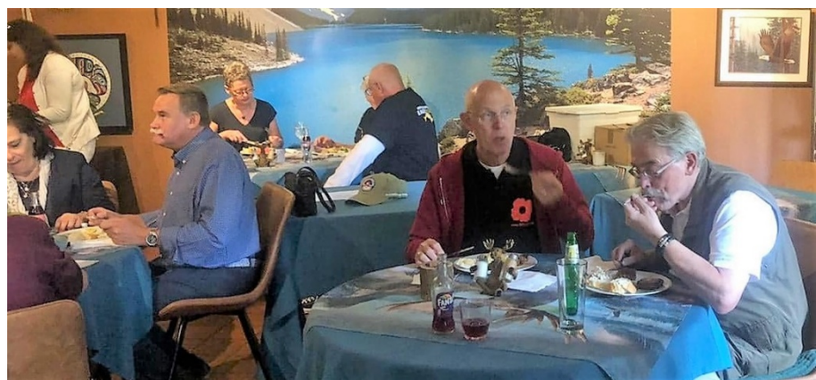
And...does it taste? It tastes!!