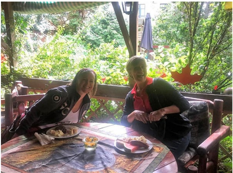
Never a dull moment