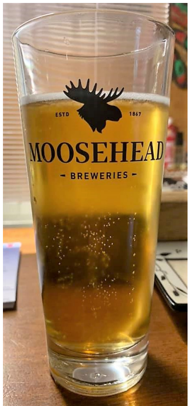
A little (?) lager.