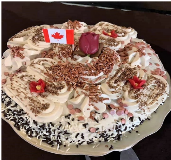
Low Calorie ?? !!