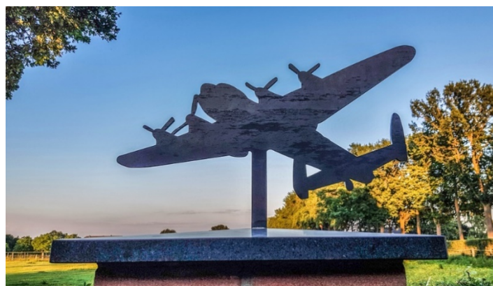
Detail monument.

For a short video impression: click on photo. →