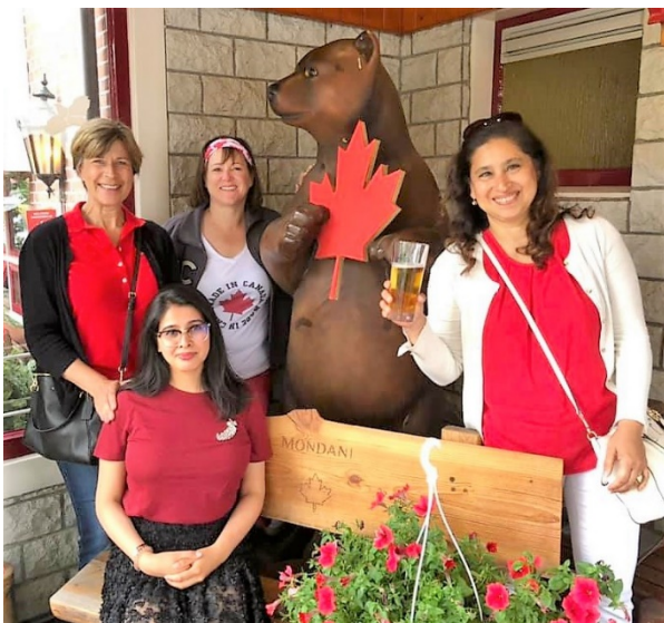
The Embassy delegation

Those who did take the trip unanimously agreed that after a long period it was nice to meet acquaintances and catch up.