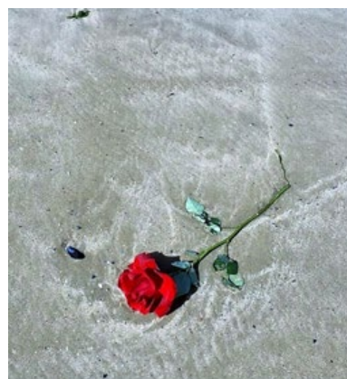
Juno Beach 3