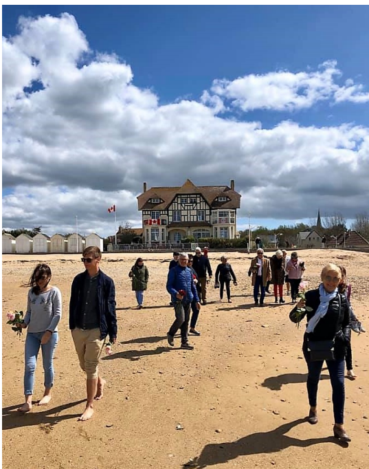
Juno Beach 2