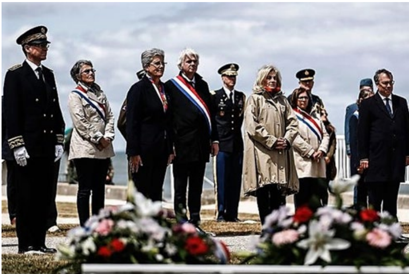
Omaha Beach

In Vierville-sur-Mer, Omaha Beach, on one of the main landing sites, only a hundred or so attended the ceremony. Among them the ambassadors of the eight Allied countries (Canada, Denmark, Great Britain, Poland, Belgium, Norway, the Netherlands and the United States) and Germany, for the US National Guard