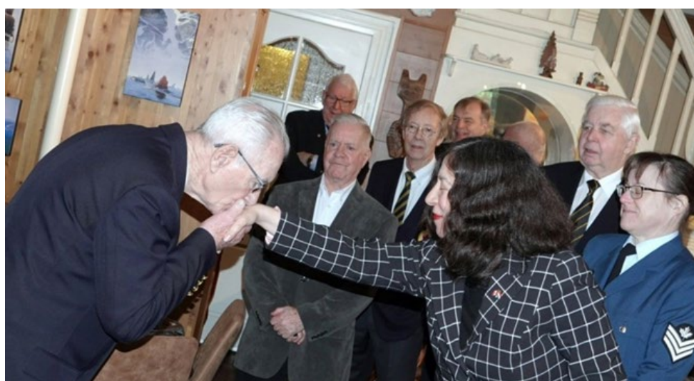
Our Navy man; a true gentleman every inch