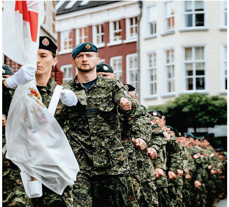
Bergen op Zoom

In 2018 the memorial was held for the first time on the Monday before the start of the hiking tours. For this, the memorial was inserted on the third day (Seven Hills Route). The disadvantage was that the soldiers arrived one after the other. The former had to wait; the latter had to pass almost immediately for the ceremony. A little care and a short rest were hardly there for them. So, no good conditions to stand still for an hour to attend a memorial. The cemetery is still visited on Thursday and a small memorial is added per regiment or individually. The foreign troops also pay tribute to the soldiers who are buried here.