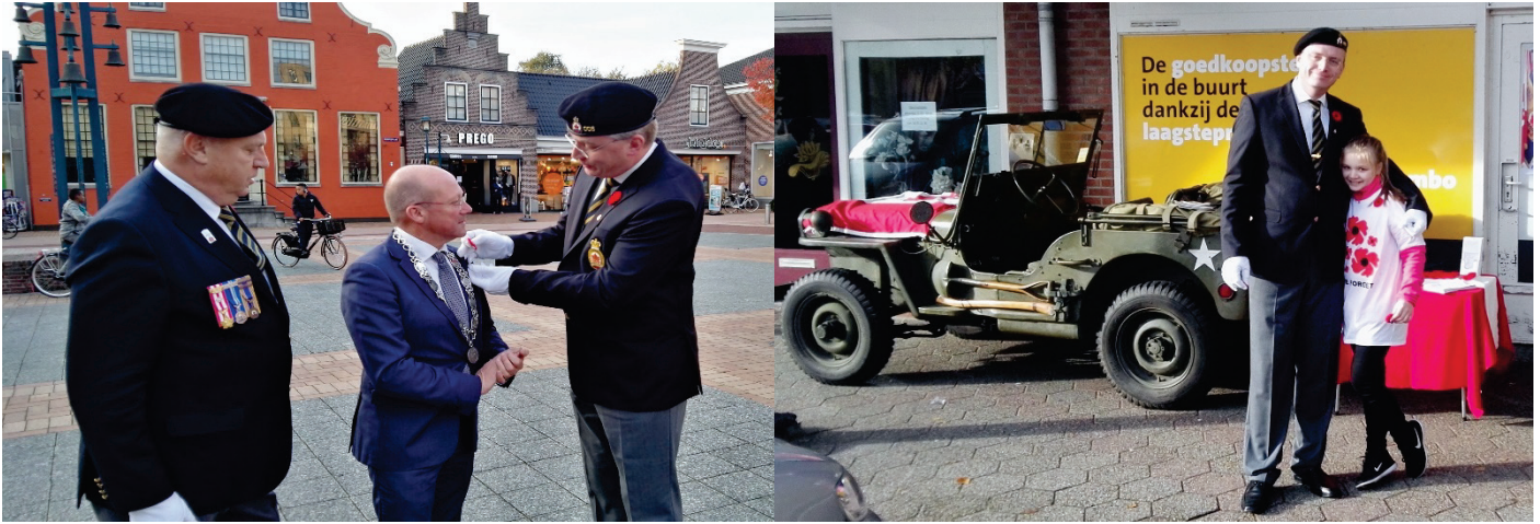
Wilnis (Municipality De Ronde Venen)

Finally, a poem by PAUL HUNTER , that really touched me. Short and powerful, but with a world of feelings in it, which paint the exact meaning of a poppy on a lapel.