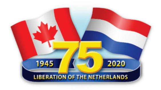
President Royal Canadian Legion Branch 005